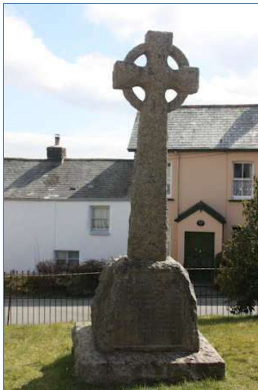
Bratton Clovelly World War I Memorial