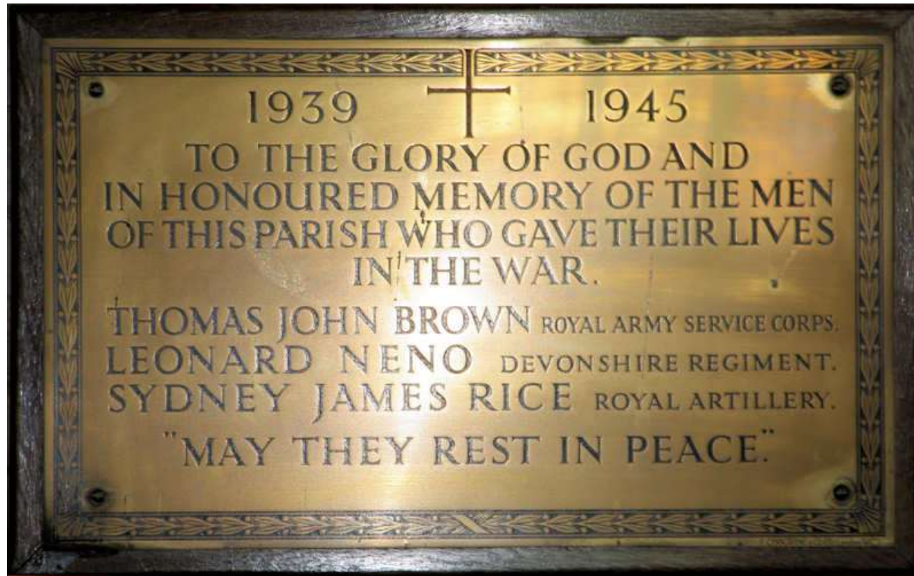
Bratton Clovelly World War II Memorial Plaque St Mary's Parish Church